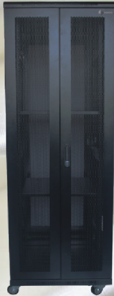
Perforated split double door