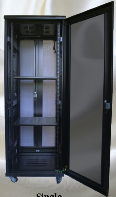
Single glass door