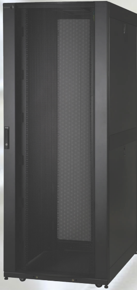
Perforated single door